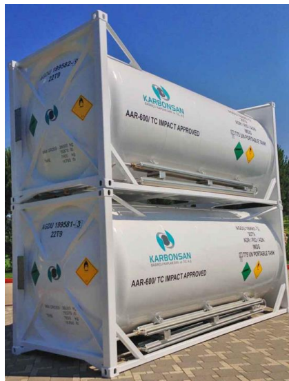
Fig. 4. LNG container.

One of latest conception is container with LNG, which technically is similar to truck type tank with proper insulation and some devices enabling its connecting, filling and monitoring. Tank is usually one or two sided semi pressure tank in form of cylinder inside the typical container (20'' or 40'' size) frame isolated from outer world with special foam and housing. Some companies has designed and produced such containers working at pressure P=0.5 MPa and with outer insulation can holds up to 50m 3 of LNG with self-cooling time for around 1 month. Container of 20 feet equivalent is presented at fig. 4.