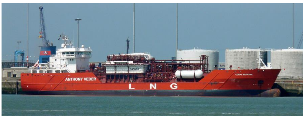
Figure 2. Feeder A Q=7000 m 3 LNG (LOA 117m).

Bunker vessel/barge capable to fill other ships with LNG bunker must be equipped with: