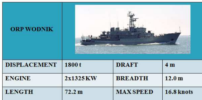
Fig. 2. Vessel characteristics [own study]

According to the conception it is assumed that the tests are performed by two main stages. The first of them are manoeuvring trials carried out in real conditions. At this stage the vessel's manoeuvrability at various meteorological conditions is to be analyzed. For this purpose RP Navy vessel ORP 'Wodnik' is to be used; the basing parameters of the vessel are presented in Fig. 2.